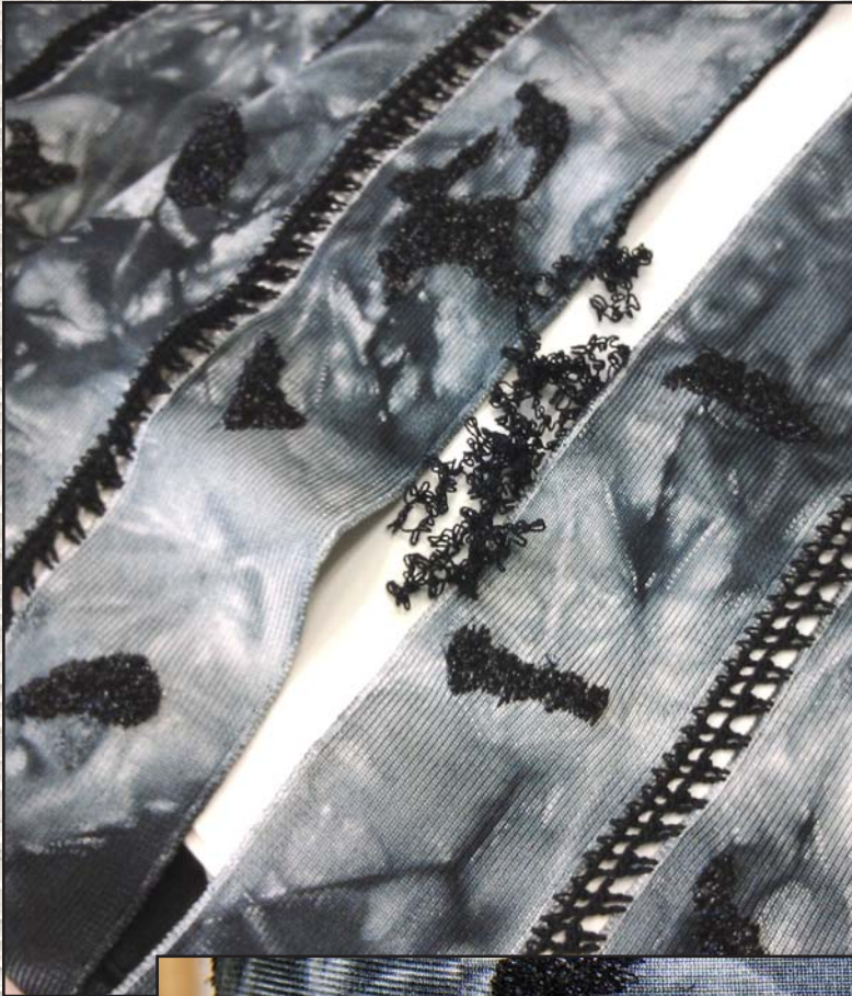
Crochet Repair on Herve Leger Dress