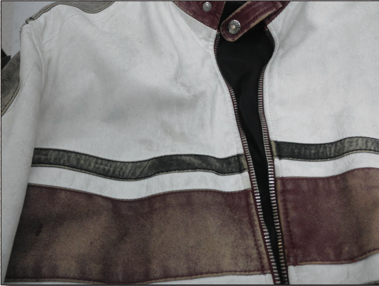
Dolce & Gabana Leather Jacket