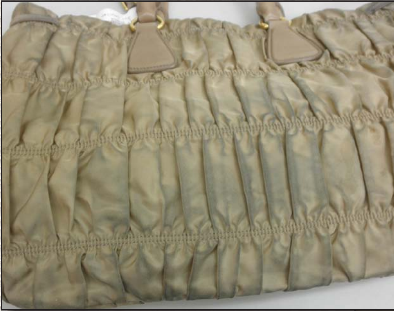
Prada Handbag Before